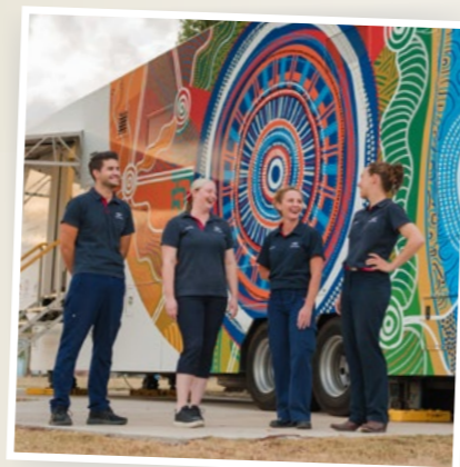
Our dental service brings world-class dental care to Queensland's most remote communities.