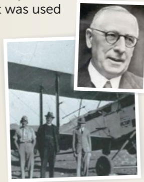
Reverend John Flynn's dream of the Flying Doctor was achieved thanks to a Gift in Will, which allowed him to lease his first aircraft.

Today, we're hoping you too will make a gift in your Will, so we can go further for generations to come.